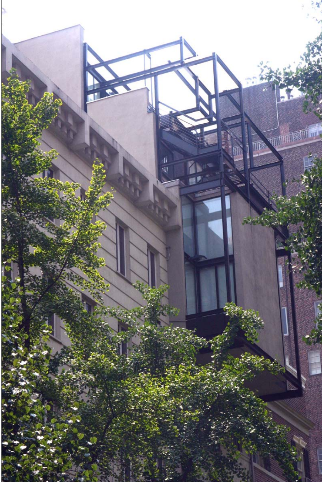
Paul Rudolph Penthouse & Apartments Beekman Place facade, from the north Photo: Carl Forster, 2007