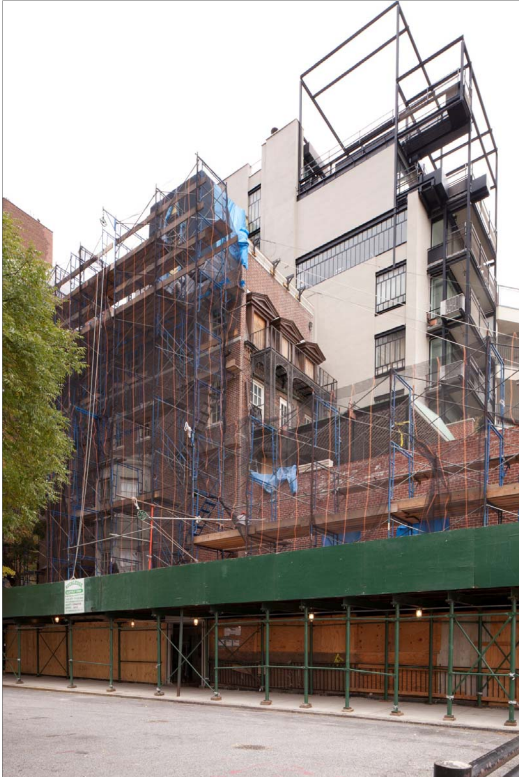
Paul Rudolph Penthouse & Apartments South facade, facing 50 th Street