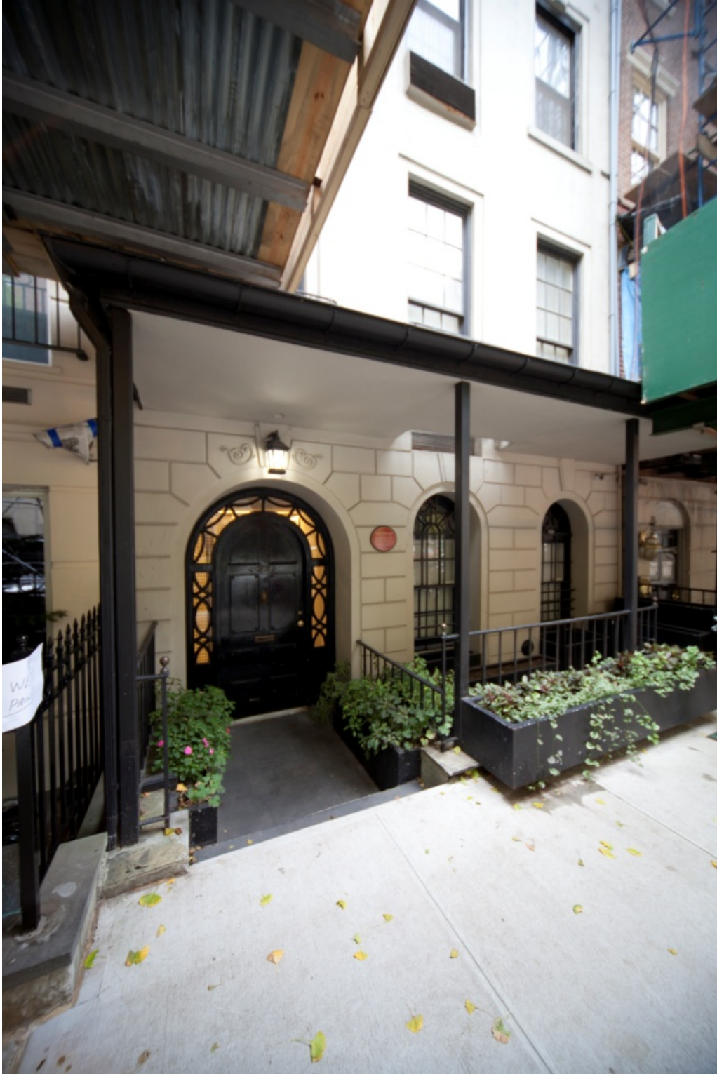
Paul Rudolph Penthouse & Apartments Beekman Place, entrance