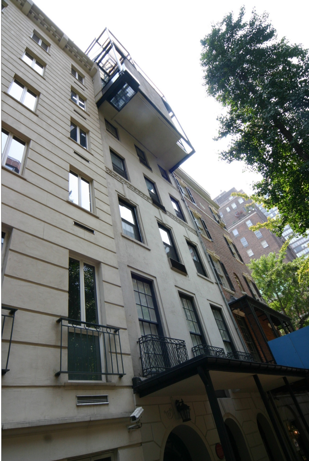
Paul Rudolph Penthouse & Apartments Beekman Place, main facade Photo: Carl Forster, 2007