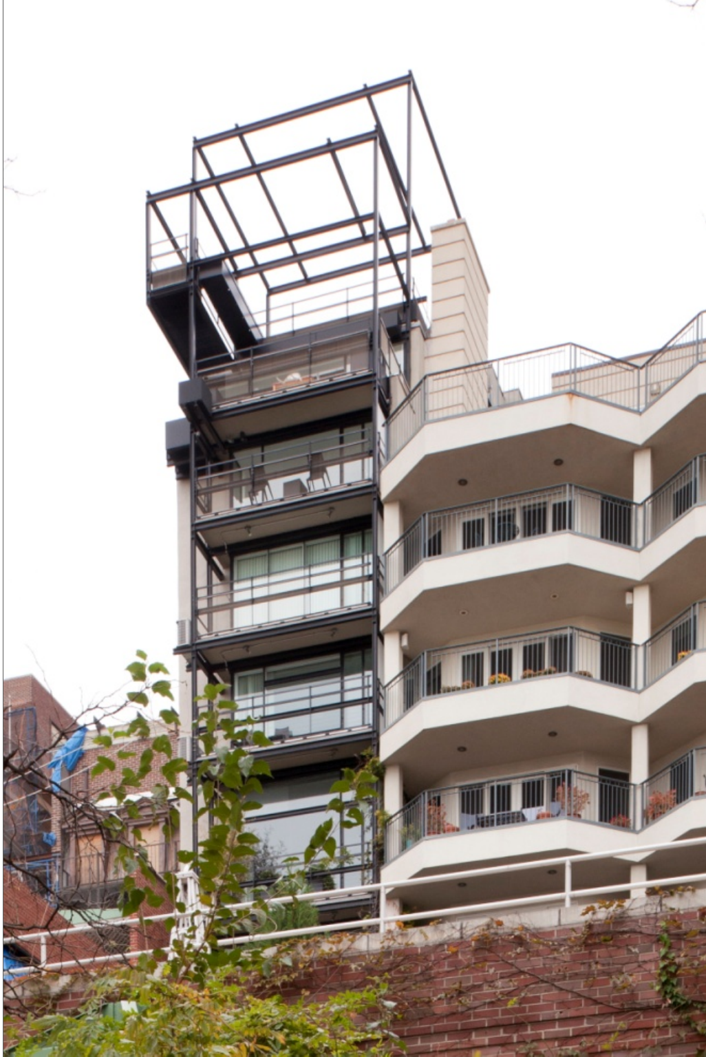
Paul Rudolph Penthouse & Apartments East facade, facing Queens