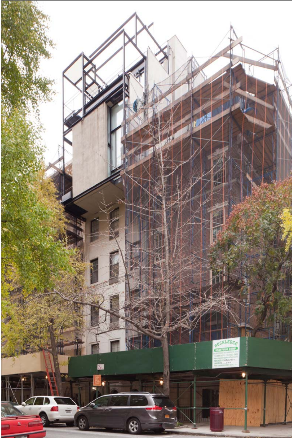
Paul Rudolph Penthouse & Apartments 23 Beekman Place, Manhattan